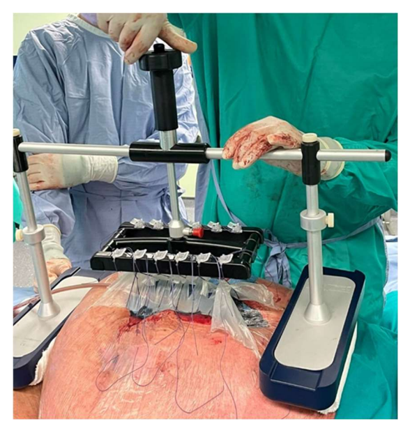
Figure 3: Installation of Fasciotens© Abdomen

dosage of diuretics was decreased the following day.