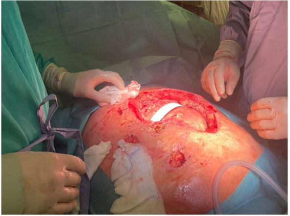
Figure 2: Fascial gap of 15 cm before Fasciotens© Abdomen installation

On the twenty-fifth postoperative day, with low inflammatory parameters values and no signs of peritonitis, we decided to install the Fasciotens© Abdomen system in combination with the ABThera<sup>™</sup> system for primary closure of the abdominal wall fascia (Figure 2).