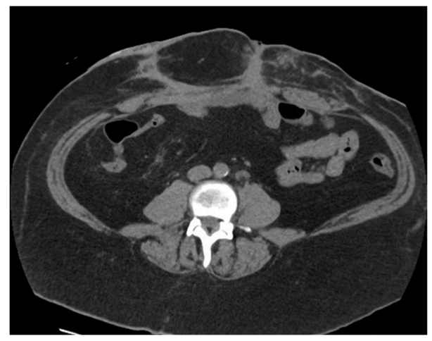
Figure 4: CT scan before discharge. No dehiscence along median laparotomy.

(Figure 4). No sign of dehiscence along median laparotomy was observed, although multiple fascial defects of the anterior abdominal wall were still seen. He continued with his rehabilitation and physical therapy in the medical center.